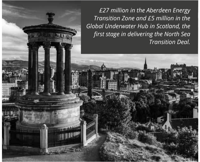
£27 million in the Aberdeen Energy Transition Zone and £5 million in the Global Underwater Hub in Scotland, the first stage in delivering the North Sea Transition Deal.

Where spending decisions apply to Great Britain, the Northern Ireland Executive will be funded to replicate the arrangements in Northern Ireland. ◀